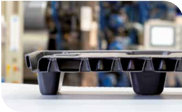
Twin-sheet thermoforming technology

technology for lid and base production and expertly designed core structure in its sleeve ensure highest performance and reliability in transport packaging.