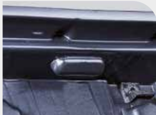
Self-locking lid closure