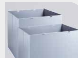
Customized sleeve height