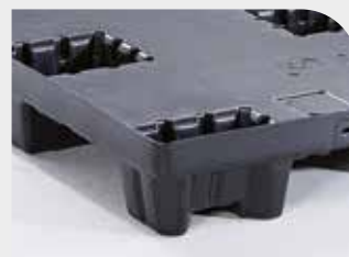
Heavy-duty pallet base

ID PACK is a professionally engineered sleeve pack system which provides – as standard equipment – everything needed for top-notch efficiency and cargo safety. Its stack-supporting top lid, collapsible protective sleeve and rock-solid pallet base set new standards in reliability and safety. In addition, a wide range of options is available for configuration in accordance with your specific needs.