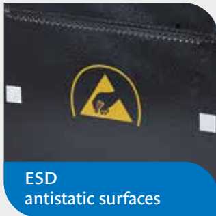
ESD antistatic surfaces