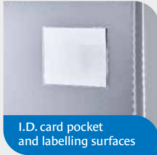
I.D. card pocket and labelling surfaces