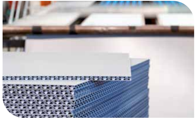
TRIPLEX structured-core technology