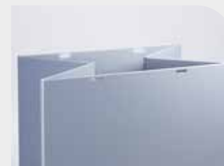
Side folds for flat collapsing of sleeve