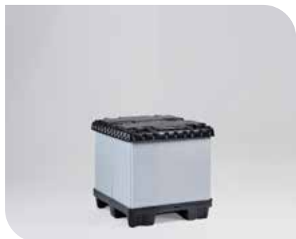
ID PACK 24 x 32