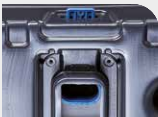
Safety lock in pallet base