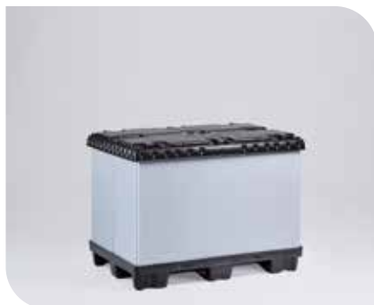
ID PACK 32 x 48