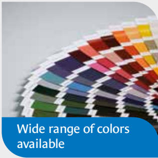
Wide range of colors available