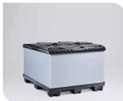
ID PACK 63 x 48