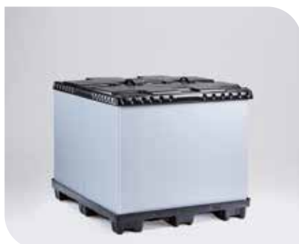
ID PACK 59 x 48