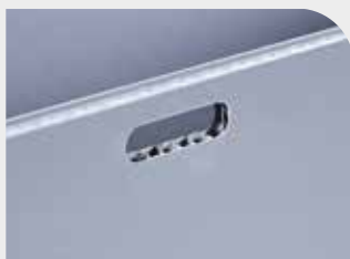
Locking holes in sleeve for base and lid