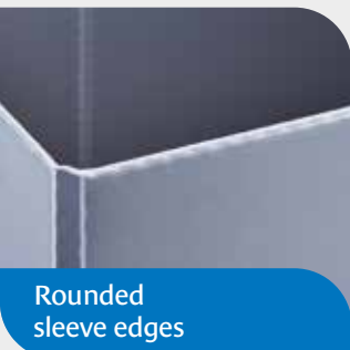
Rounded sleeve edges