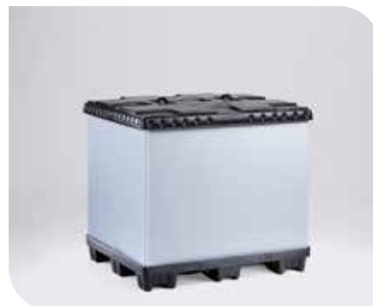
ID PACK 40 x 48