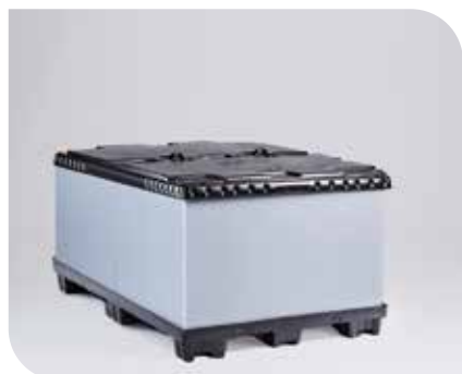
ID PACK 72 x 48

FOR MORE INFORMATION, PLEASE DOWNLOAD THE ACTUAL TECHNICAL DATASHEET