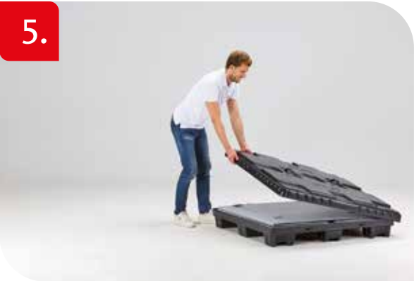
PLACE LID ON TOP