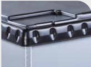
Lid with self-levelling stack recesses