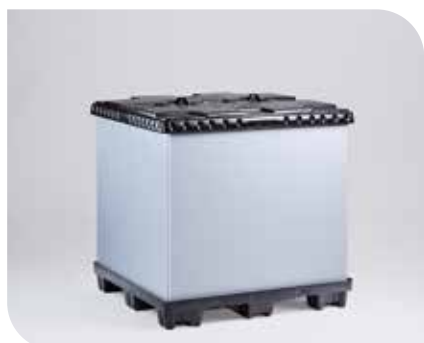
ID PACK 45 x 48