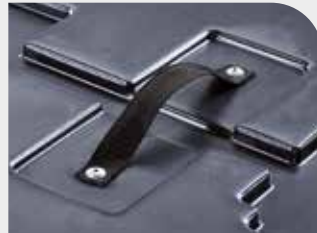
Convenient grip straps for lid removal