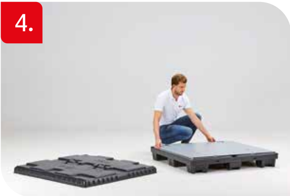
PLACE COLLAPSED SLEEVE ON BASE