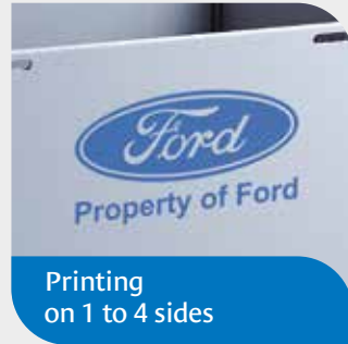
Printing on 1 to 4 sides