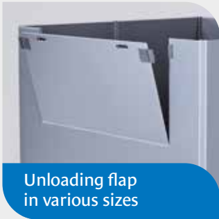
Unloading flap in various sizes